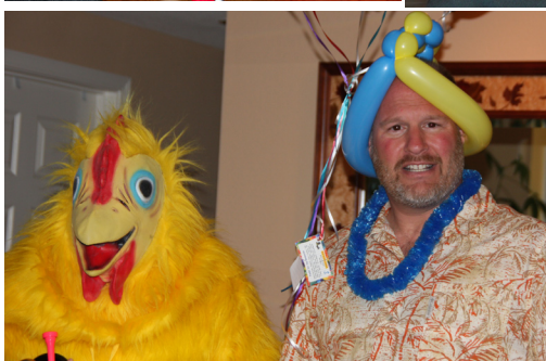
I had a birthday party. And then this chicken showed up. Before I knew it there were balloons on my head, so I was told.. I think it was all made up! Are you going to believe me or your lyin' eyes!?