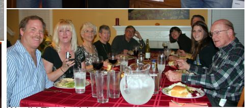
We did Thanksgiving at our house again. It was a happy, well fed crowd. There was also the annual soccer game with a little spying on the opposing team huddle thrown in.