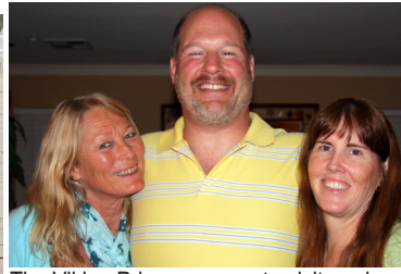
The Viking Princess came to visit again. Always a good time when she's in town.